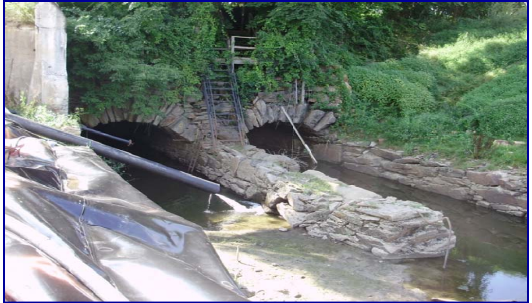
The two raceway tunnels were each over 600' long with a 200' branch connected to the tunnel on the left.

WSLP-2400 Polymer Make-down unit Mixing Manifold Sample and injection