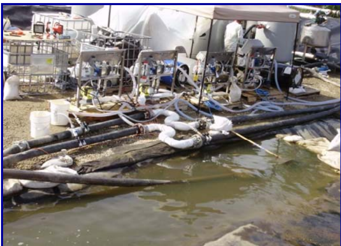
Polymer make-down units and related piping.

This process was very effective and two additional polymer make-down units were delivered to the site for this process. The south Geotube® container became a polishing container and the north container became the dredge residual container. A dam was constructed in the sump between the containers and a pump transferred water from the south container to feed the water treatment plant while the north container effluent water returned to the raceway. As the job progressed, excavators were used to gather mud and place it in a container with a screen over it to help separate debris. Water was added and the slurry was pumped to the north (dredge) Geotube® container.