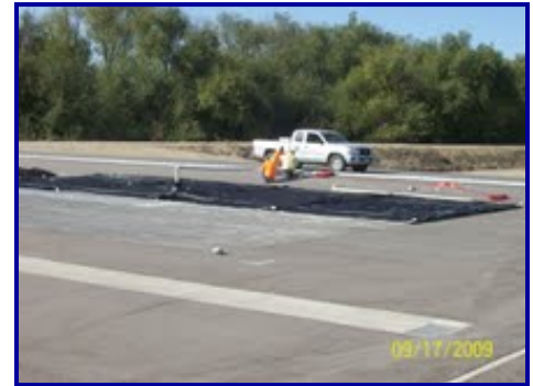
Setting up Geotube® container.

Clearwater Dewatering trained the Wastewater Treatment Plant personnel and superintendent in the proper procedures for installing and filling the Geotube® container. This included testing and adjusting the polymer dosage and mixing rate as the material is treated and sent to the Geotube®. The digester tank solids will need to be transferred to Geotube® units two to three times annually. After the Geotube® units are filled and adequately dewatered, they are cut open and the solids are hauled to a landfill for final disposal.