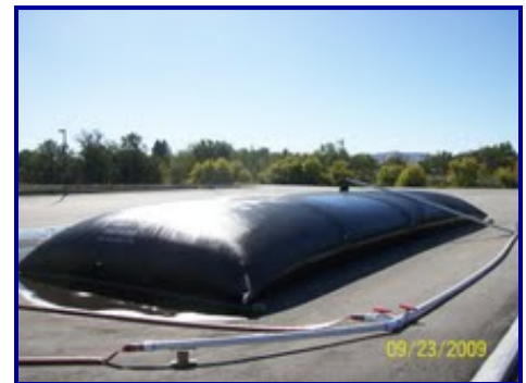
Filled Geotube® container ready for disposal.