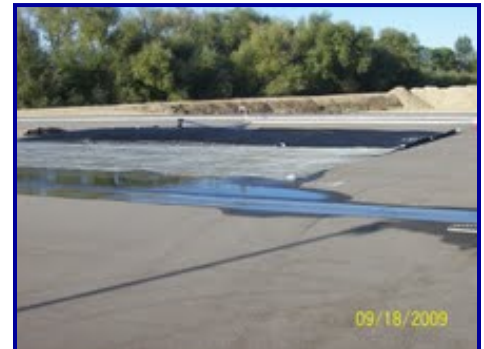
Filling Geotube® container.