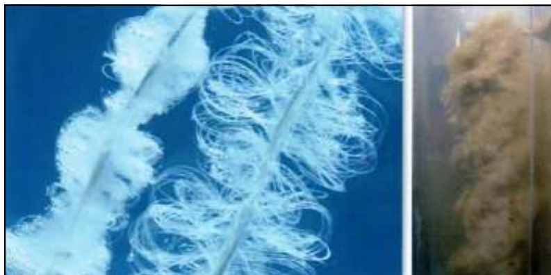
Clean BioCord material shown on the left. BioCord with accumulated Biofilm shown on the right