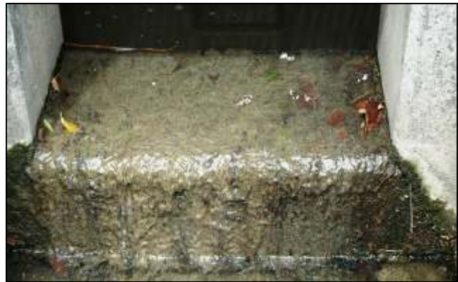
Natural Biofilm Growth on concrete drain