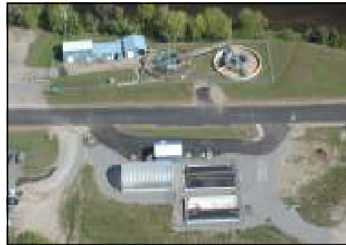
Award Winning Bonnechere Valley Township Geotube® Sludge Management Facility